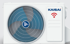
Outdoor unit KWX